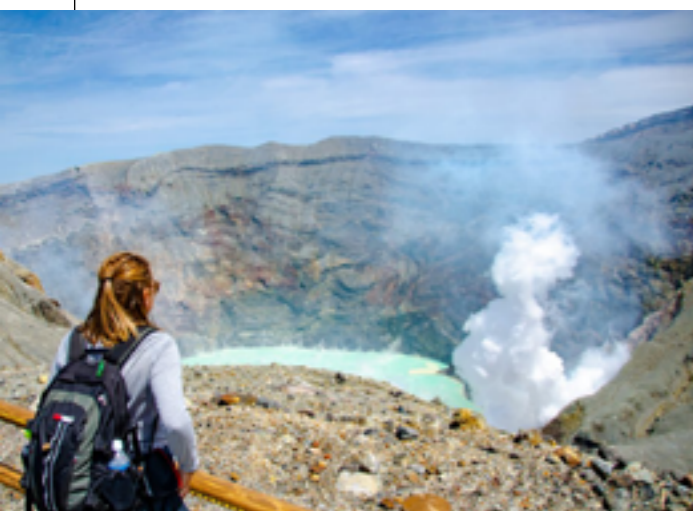
The Aso Park Toll Road offers easy access to the crater by car.