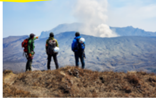
Gaze upon the traces of ancient eruptions and feel the power of the Earth